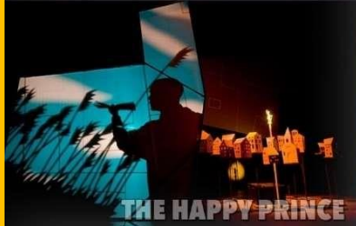
THE HAPPY PRINCE