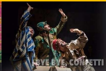
BYE BYE, CONFETTI