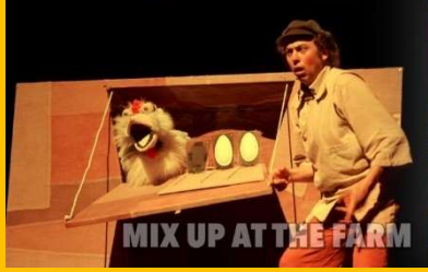
MIX UP AT THE FARM