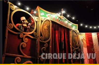
CIRQUE DE JA VU