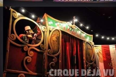
CIRQUE DEJA VU