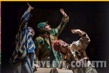
BYE BYE, COMETTI