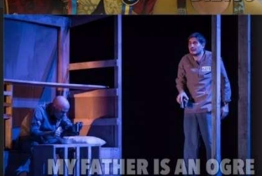
MY FATHER IS AN OGRE