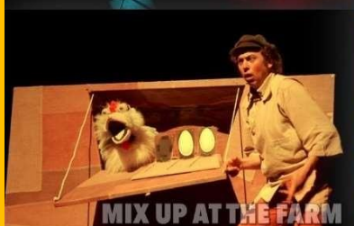
MIX UP AT THE FARM