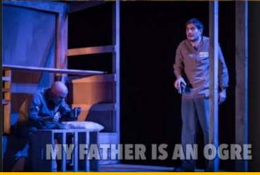
MY FATHER IS AN OGRE