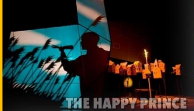
THE HAPPY PRINCE